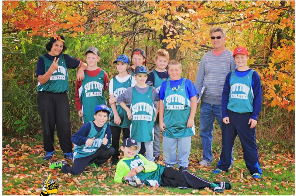
2014 Sutton P.S. Jr. Boys Baseball Team